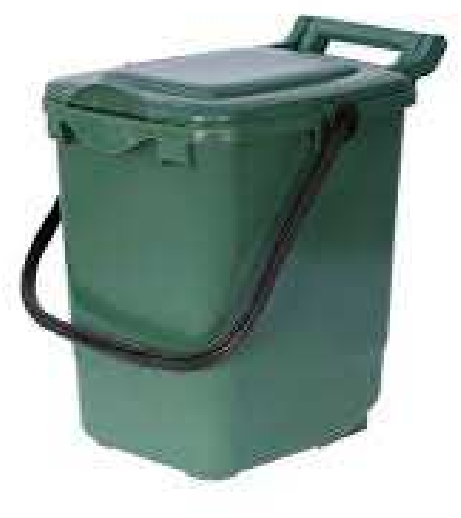
23I Food Caddy