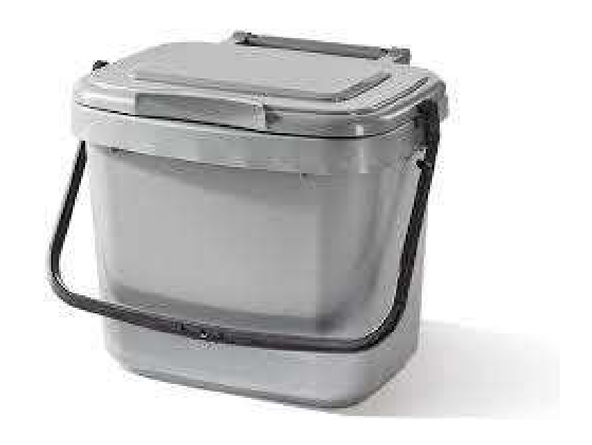
5l Kitchen Caddy